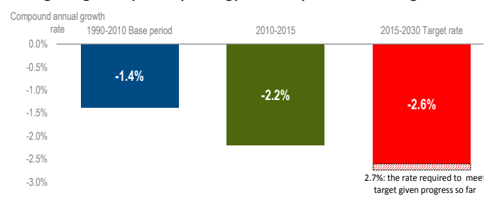
Figure 4.1 Change in global primary energy intensity relative to target