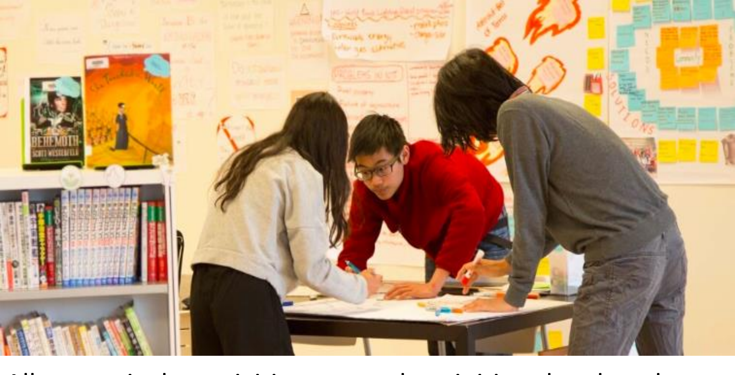
All co-curricular activities are student-initiated and student-