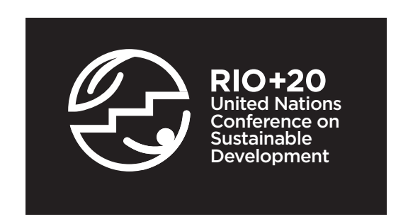
Black and White reversed