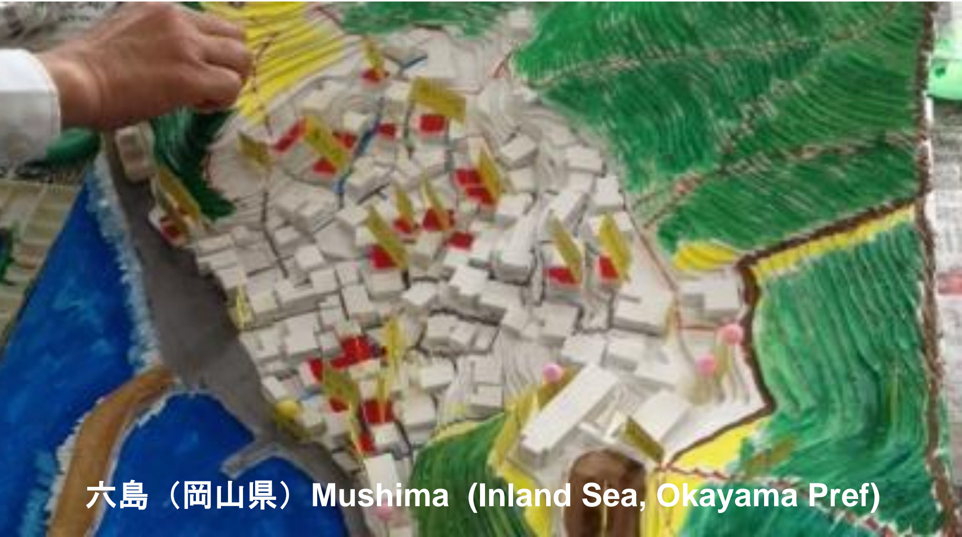
六島（岡山県）Mushima (Inland Sea, Okayama Pref)

Houses marked in red are still lived in. The rest are deserted.