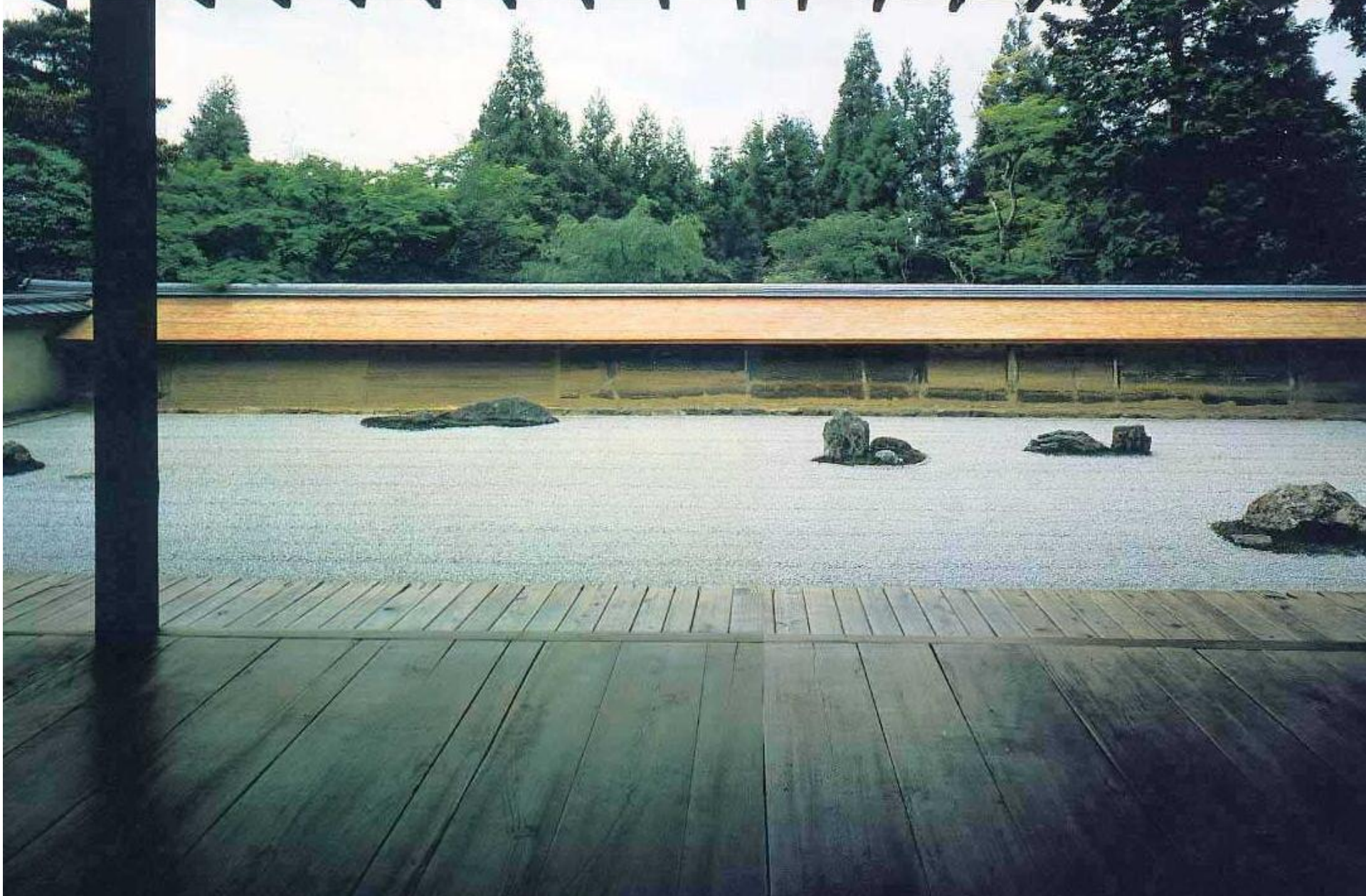
龍安寺 石庭（京都） Ryoanji rock garden, Kyoto