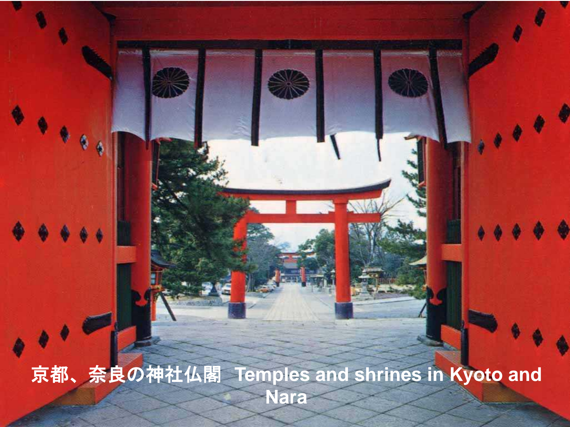
京都、奈良の神社仏閣 Temples and shrines in Kyoto and Nara