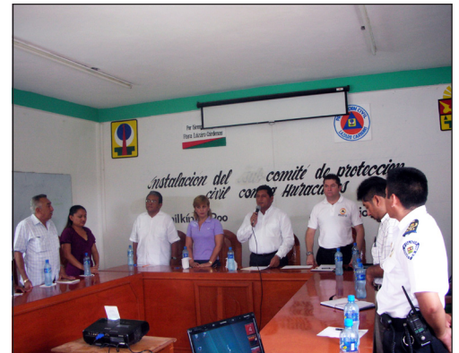
Municipal-level disaster planning in Mexico

include measures to reduce and transfer disaster risk and consider how DRM can deal with 'loss and damage' if climate change mitigation and adaptation are unsuccessful.