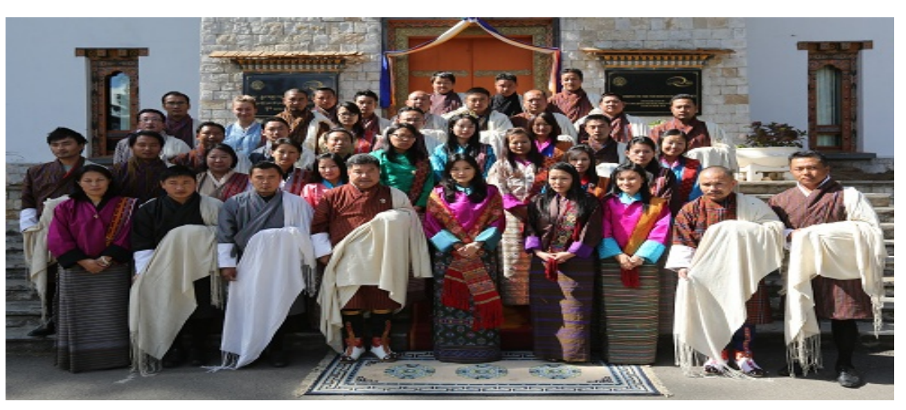
2015 - Launch of Sustainable Consumption and Production Programme