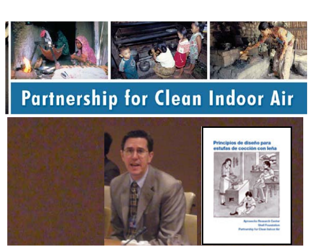
Partnership for Clean Indoor Air