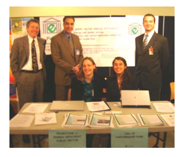
Promoting an Energy-efficient Public Sector