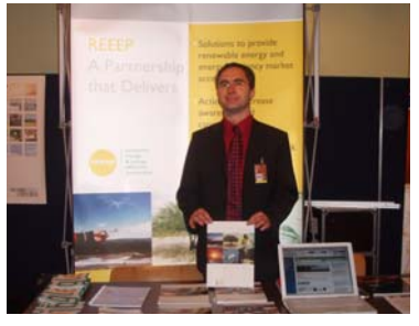
REEEP—Renewable Energy and Energy Efficiency Partnership