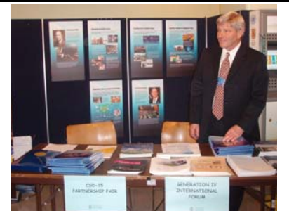
Generation IV International Forum