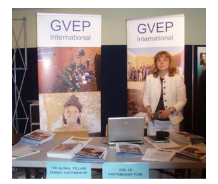
Global Village Energy Partnership