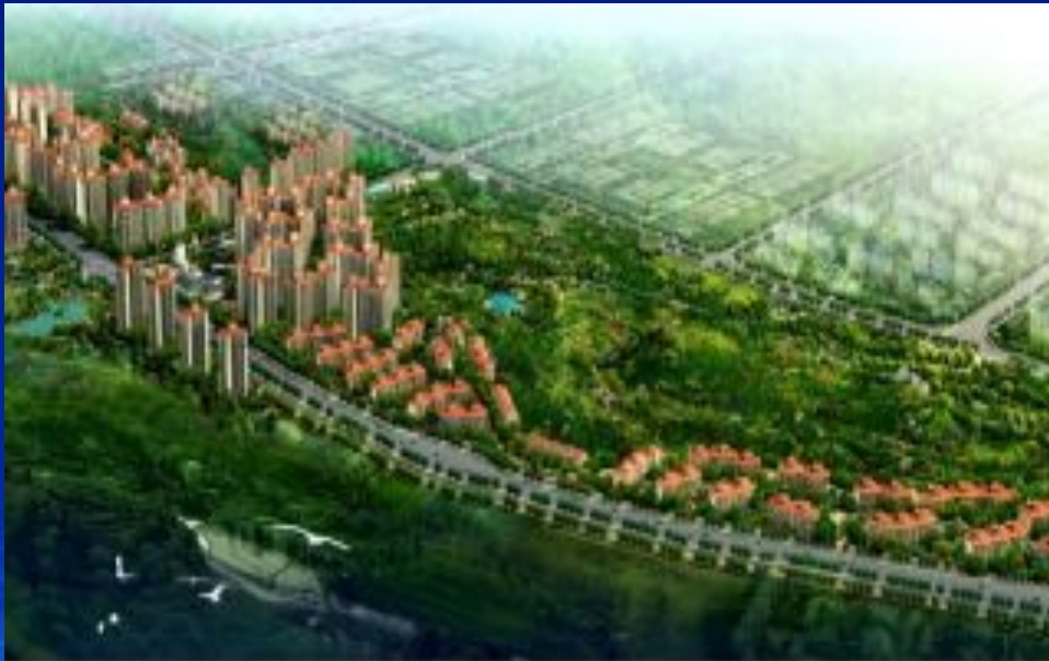
Brand I : LivCom International Garden Community