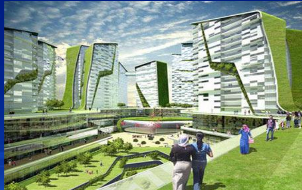
Brand II : SUC International Garden Community