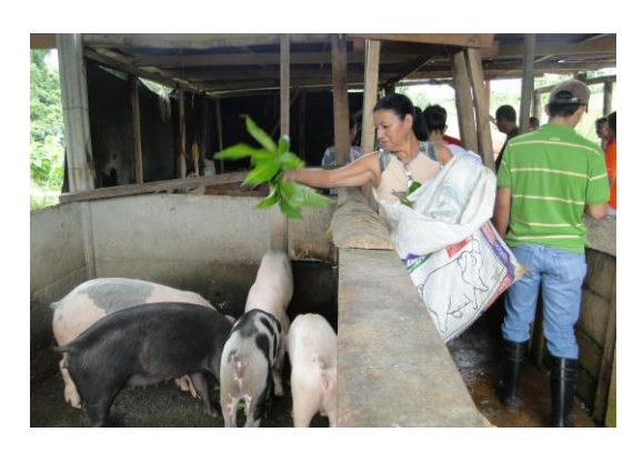
SDG#2 ZERO HUNGER