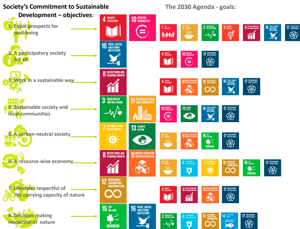
Figure 3: Correlation of the objectives set in the Society’s Commitment with the Sustainable Development Goals (SDGs) of the 2030 Agenda

This Government implementation plan is based on the vision, principles and goals set forth in Society’s Commitment, which provide a long-term framework for Finland’s sustainability work. The Commitment has also served as a central starting point for the selection of key focus areas for this plan.