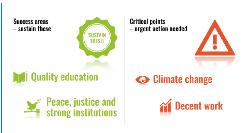
Figure 2. Key conclusions of the Avain2030 project

Finland’s starting position has been assessed in a number of international studies and surveys conducted by organisations such as the OECD 5 , Eurostat 6 , Bertelsmann Foundation 7 and the Sustainable Development Solutions Network (SDSN) 8 . These studies and reports were used in the preparation of this plan.