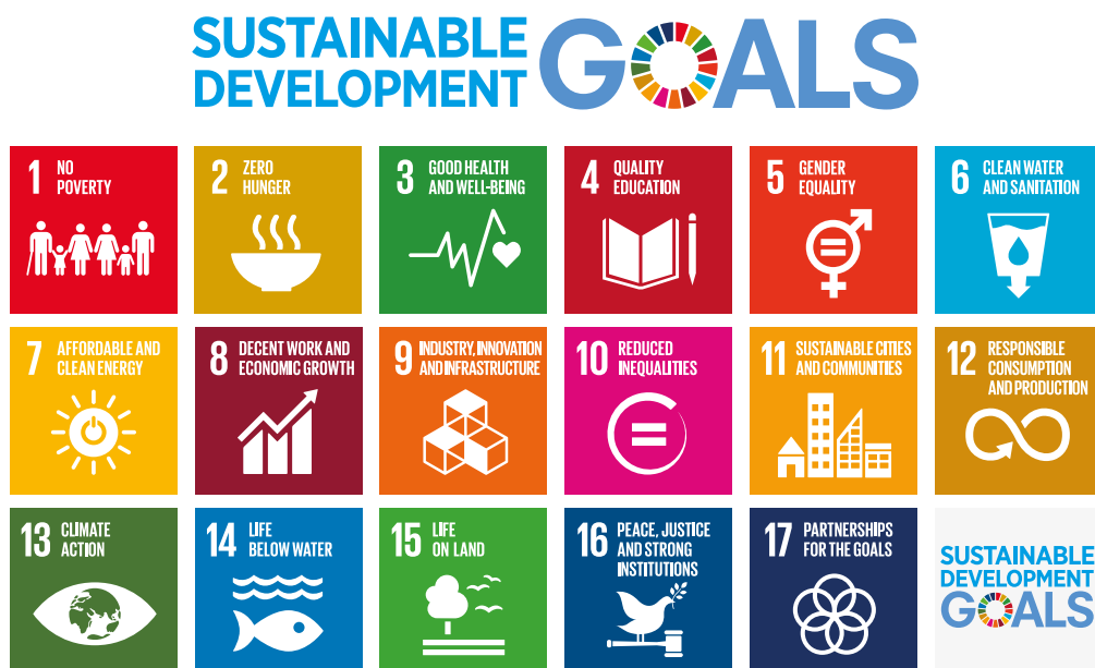
Figure 1. Sustainable Development Goals (SDG) of the 2030 Agenda

The 2030 Agenda consists of shared principles, 17 goals and 169 targets, means of implementation and a common follow-up and review mechanism. The goals of the 2030 Agenda are global and apply equally to all countries in the world. Successful implementation requires participation and input at all levels of society, but governments have primary responsibility for the implementation and achievement of the goals.