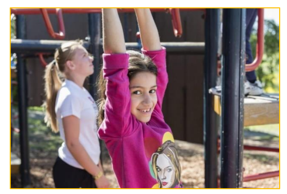
A child resident at Hvalsmoen Transit Centre plays on a SI Ringerike activity outing.

not literate in national languages. By running language courses for women, SI Ringerike provides community-based support and improves women's access to essential services.