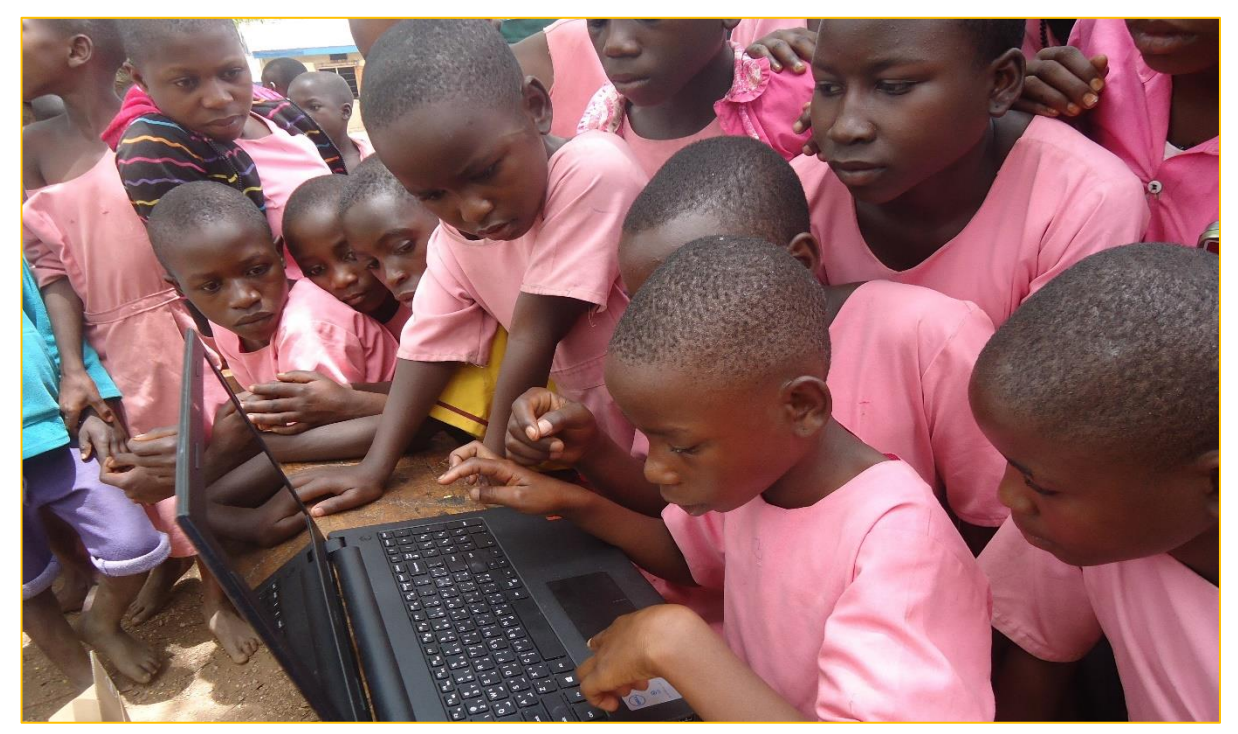
Girls at Musasa Primary School in rural Western Uganda learn to use laptops powered by solar energy.

'See Solar, Cook Solar' worked with two schools in rural western Uganda, Kinyaminagha School and Musasa School, each school with 700 pupils. Initially the project was developed to provide solar lighting and cooking facilities to the school and community, therefore increasing access to and the quality of education. However, the project quickly progressed to fulfil other needs in line with the