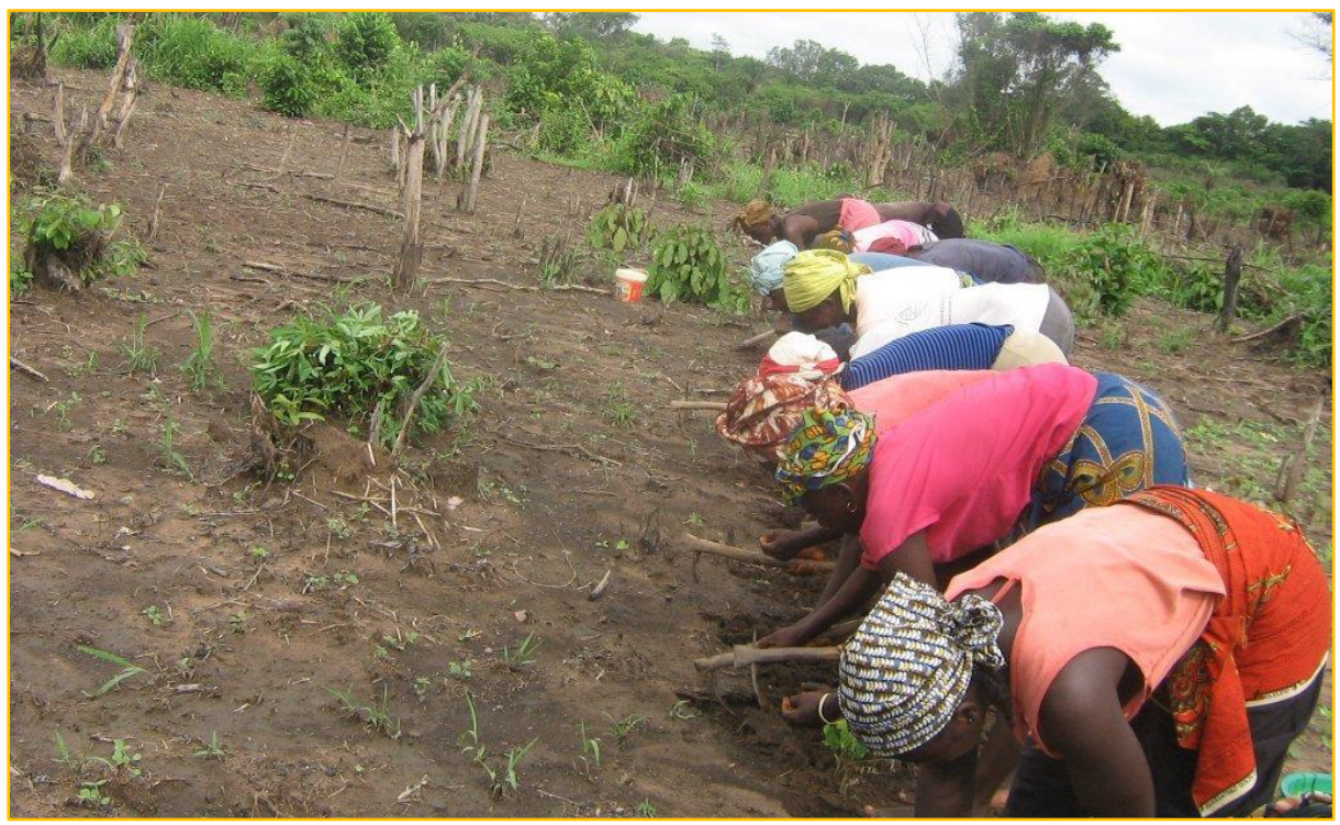
Women from Mokori Village farming as part of the Kori Project

Financing for development is key for the ongoing success of projects like the Kori Project. Many grassroots driven projects rely upon NGO and civil society funding; more support, including cash injections, should be made available to effective civil society projects to ensure their efficacy and longevity. This support can develop and maintain resources that ensure project expansion.