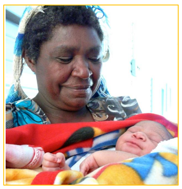
Mother & baby, beneficiaries of Birthing in the Pacific

Birthing dolls are an essential tool that train midwives, birth attendants and others in how to manage and treat complications in birth, and ensures that women access the highest possible quality of healthcare whilst in labour. This beneficial impact of this training will be particularly pronounced in rural areas, where isolation from medical facilities increase the risk of maternal and infant death, as well as other health issues.