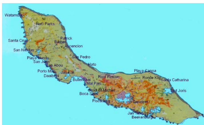
Map of Curaçao