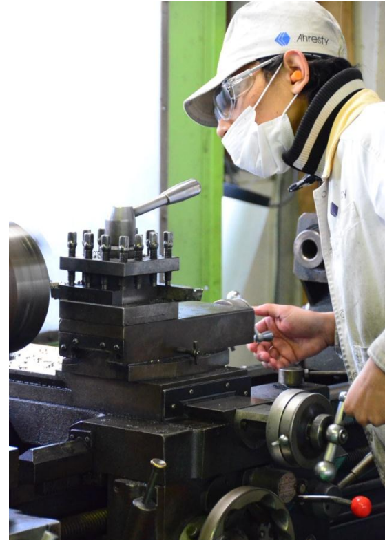
Malaysian trainee learning about machineries in Japan.