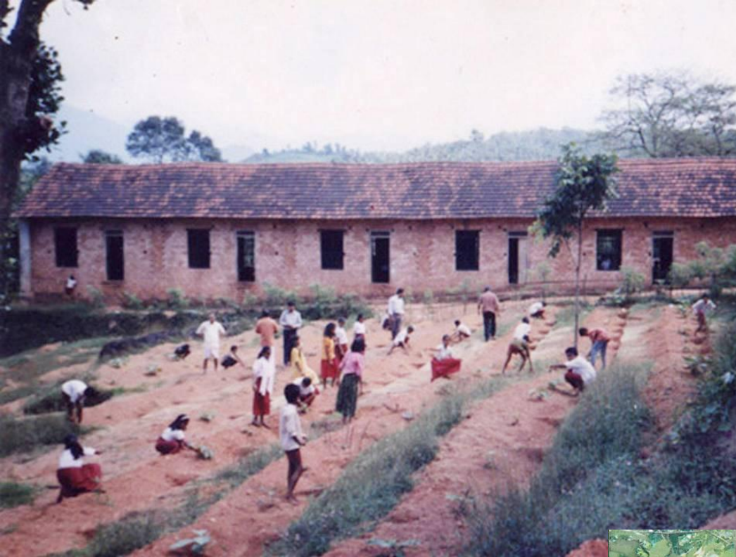
Children Planting at St Antony's UP School Kannothe, Calicut