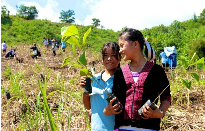
Upland reforestation project in Chiang Khong, Thailand.