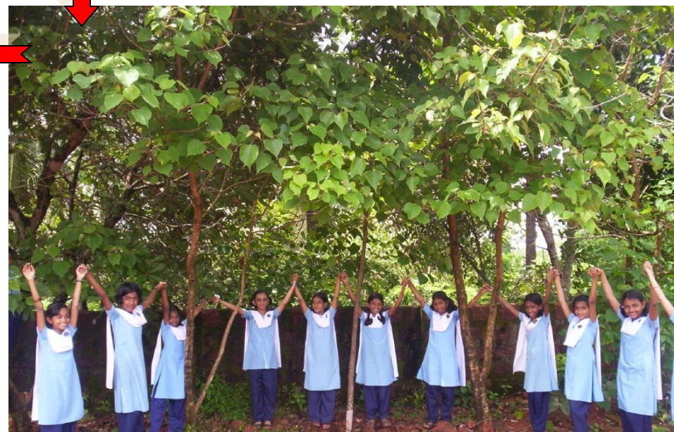
Tree Planting at Bhavan's Vidyamandir, Chelembra, Calicut