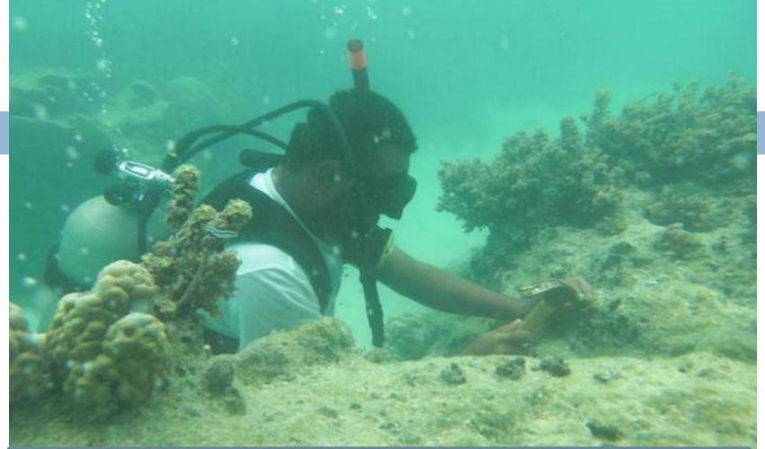
Coral reef restoration project in Fiji.