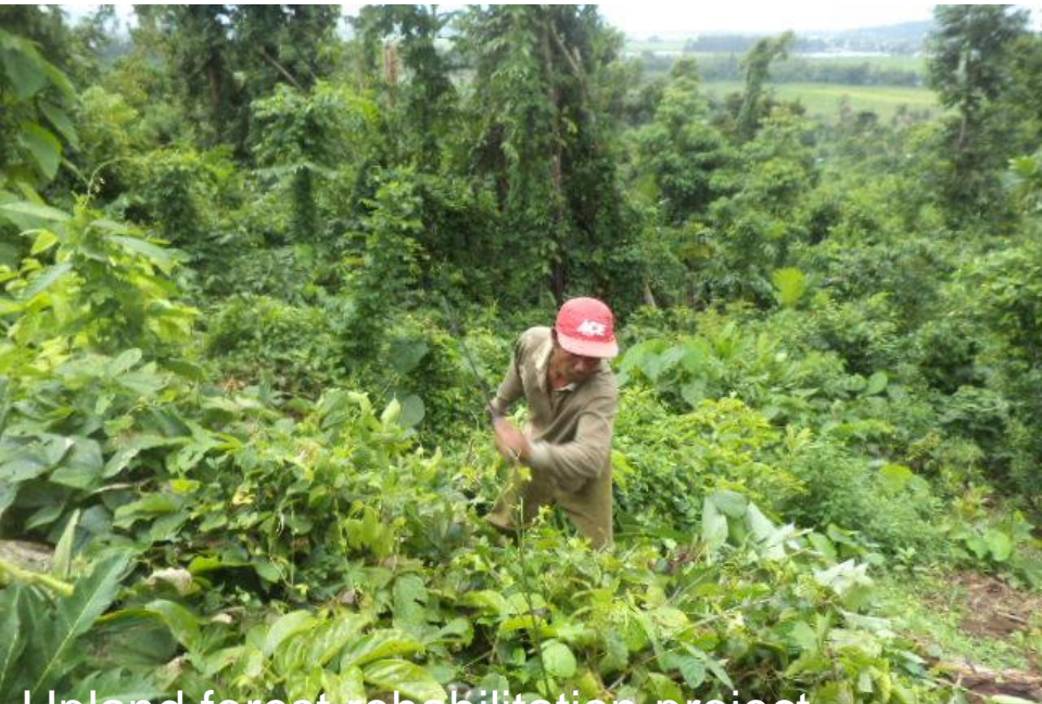
Upland forest rehabilitation project damaged by the Typhoon Haiyan in the Philippines.