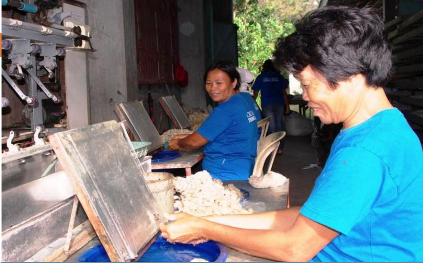
Silk production in the Philippines