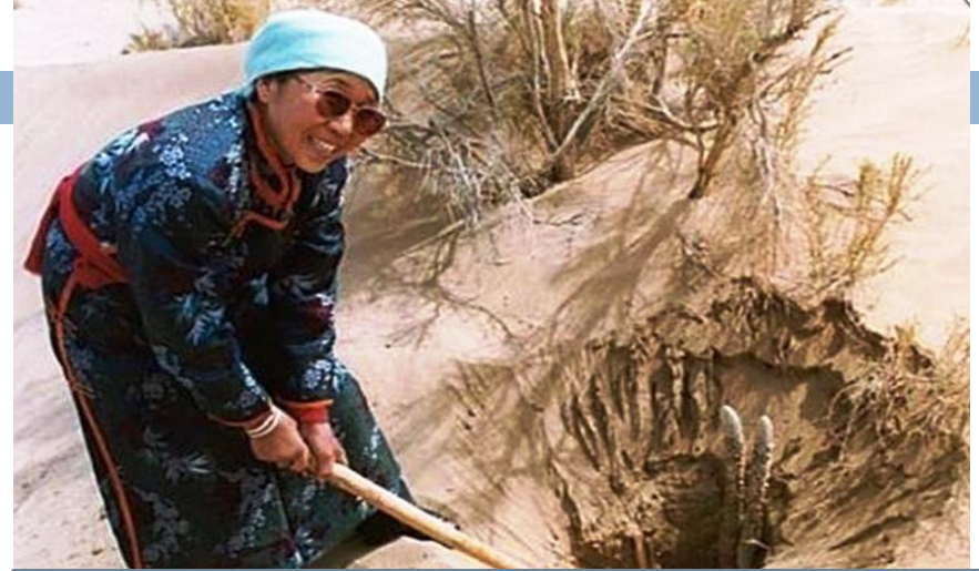
Herbal medicine production in Alashan, China