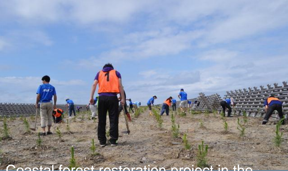
Coastal forest restoration project in the area damaged by tsunami in Tohoku, Japan.