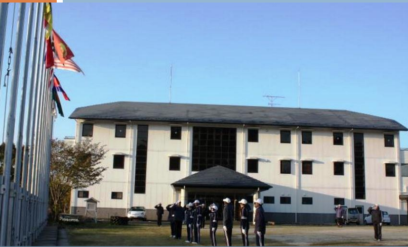
OISCA Chubu Nippon Training Center in Toyota City, Japan