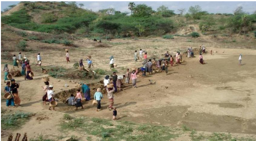
Making of artificial pond in Myanmar under the Protracted Relief and Recovery Operation (PRRO) of the United Nations