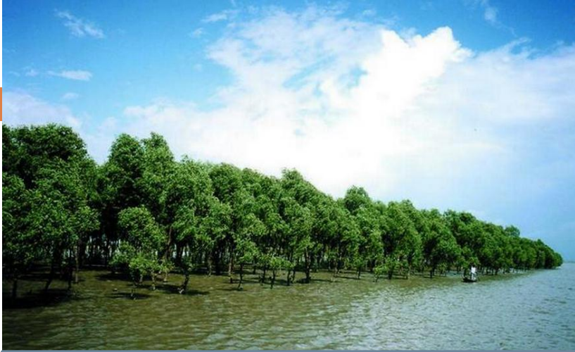
Mangrove rehabilitation project in Chittagong, Bangladesh