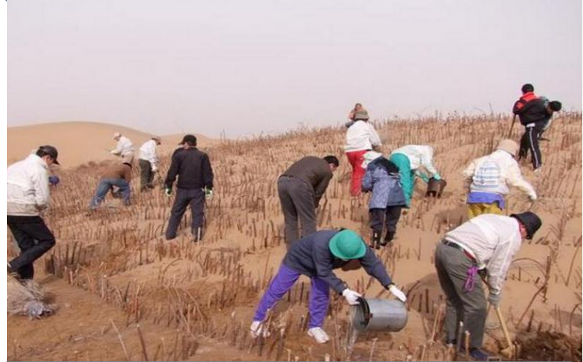
Combating desertification problem in China.