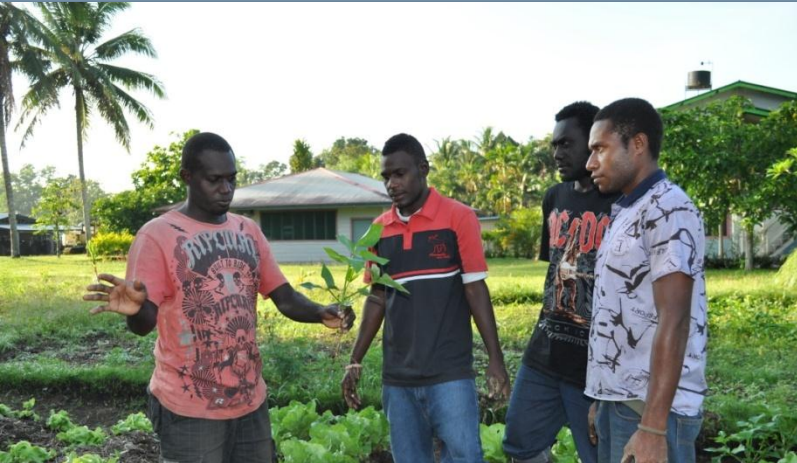
Agricultural training from OISCA Japan training center now serves as a community leader in Papua New Guinea.