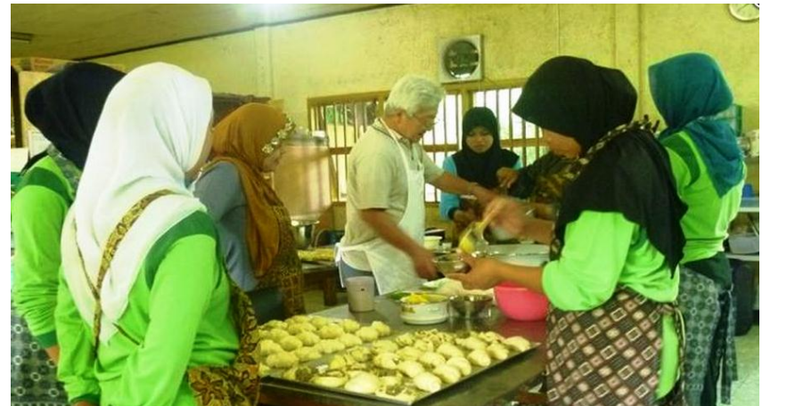
Women empowerment in Indonesia through Home Industry Project.