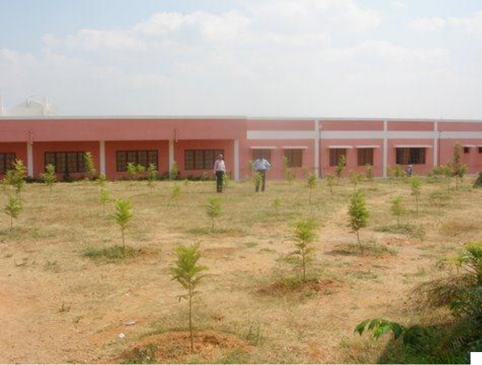
Toshiba Forest in Nanjangud