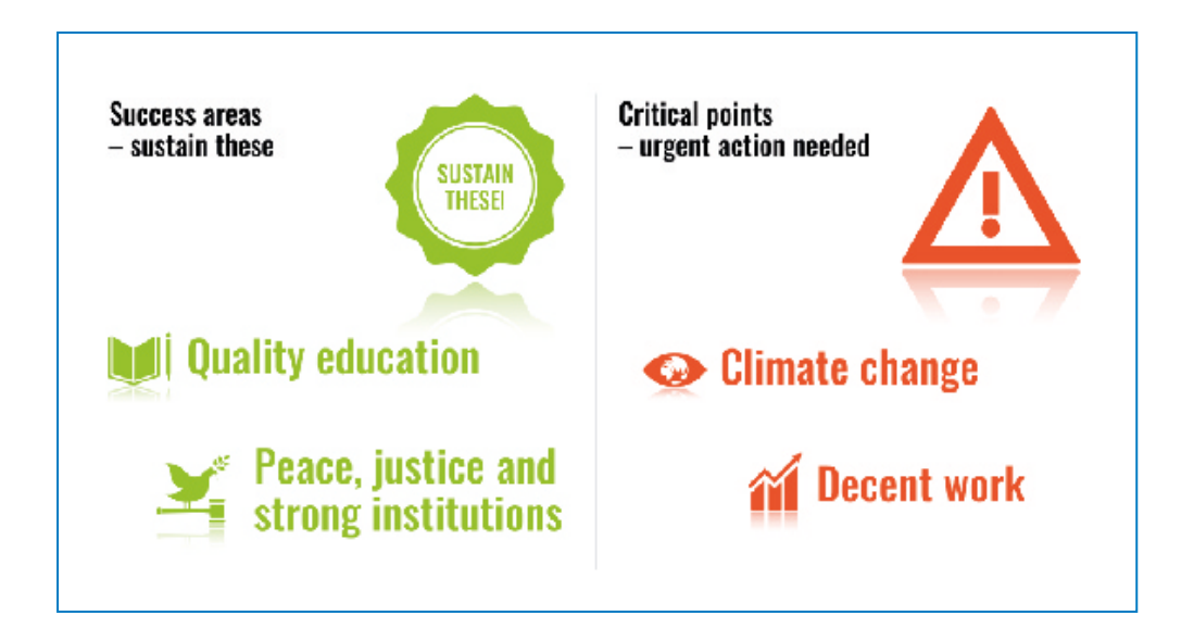
Figure 2. Key conclusions of the Avain2030 project

Finland's starting position has been assessed in a number of international studies and surveys conducted by organisations such as the OECD<sup>5</sup>, Eurostat<sup>6</sup>, Bertelsmann Foundation<sup>7</sup> and the Sustainable Development Solutions Network (SDSN)<sup>8</sup>. These studies and reports were used in the preparation of this plan.