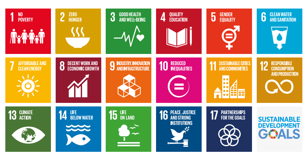
Figure 1. Sustainable Development Goals (SDG) of the 2030 Agenda