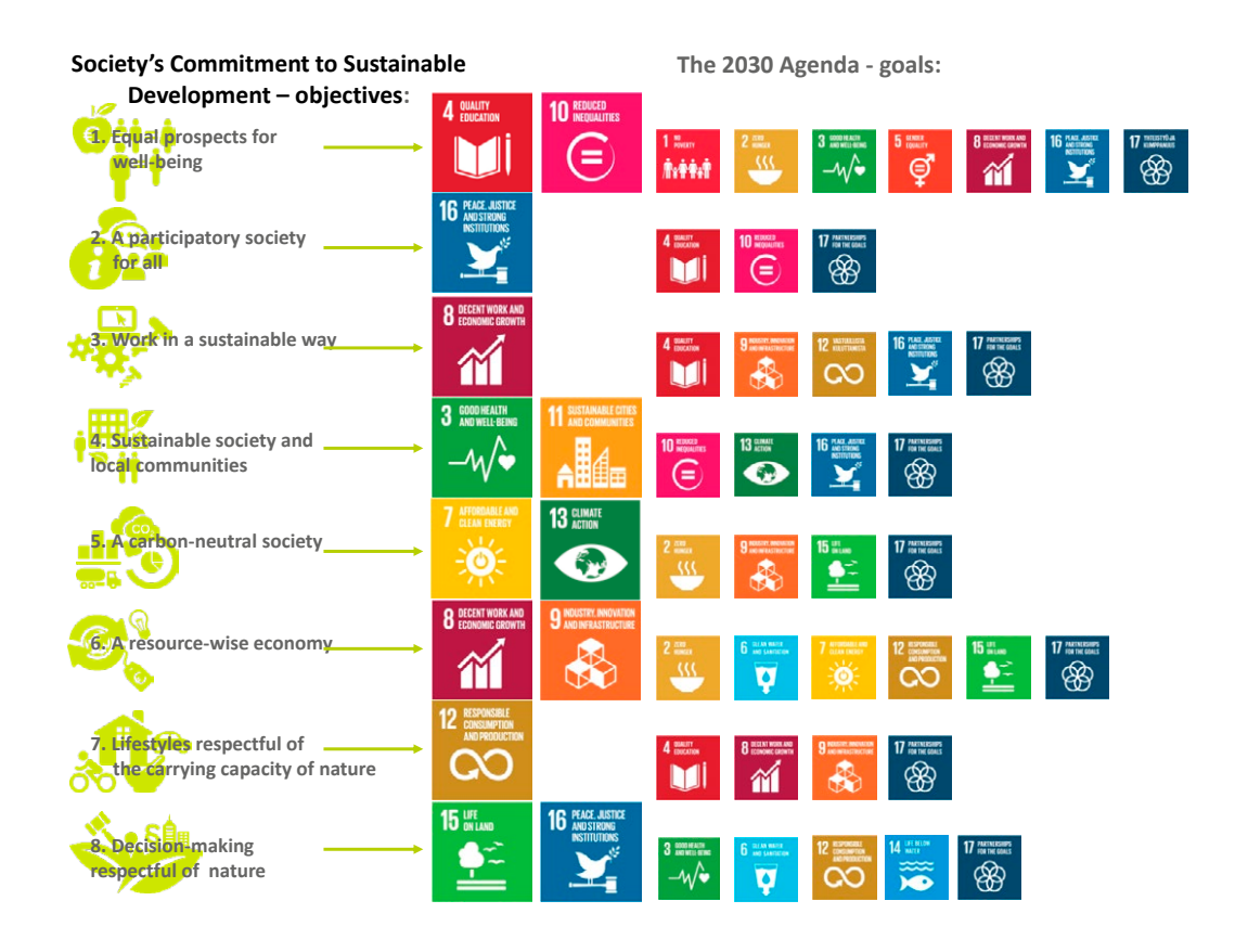
Figure 3: Correlation of the objectives set in the Society's Commitment with the Sustainable Development Goals (SDGs) of the 2030 Agenda

This Government implementation plan is based on the vision, principles and goals set forth in Society's Commitment, which provide a long-term framework for Finland's sustainability work. The Commitment has also served as a central starting point for the selection of key focus areas for this plan.