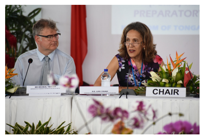
Co - Chairs

homegrown perspective and experience of a lifetime. As civil society often represents those that are marginalized, they also ensure that no one is left behind; and Partnerships need to be accountable to their beneficiaries and maintaining dialogue with communities throughout the lifetime of the partnership is important.