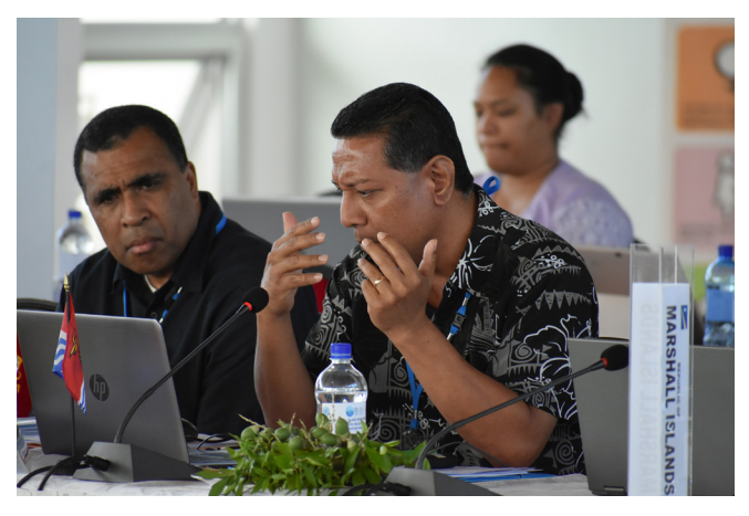
High Commissioner Teaabo (Kiribati)