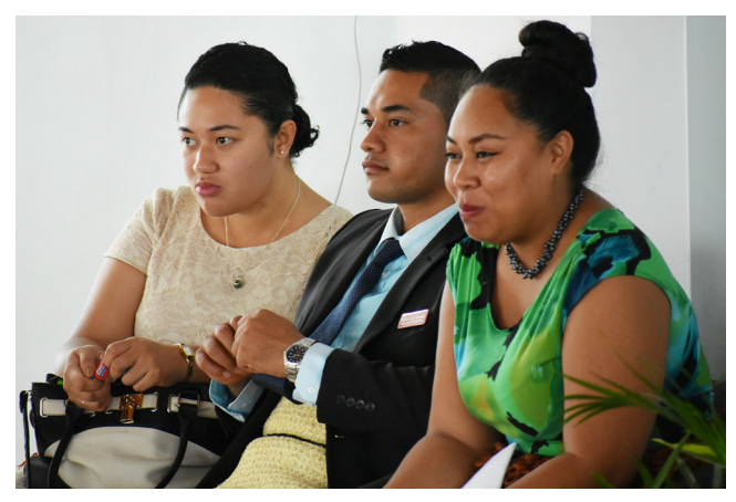
Host Country Support Staffs