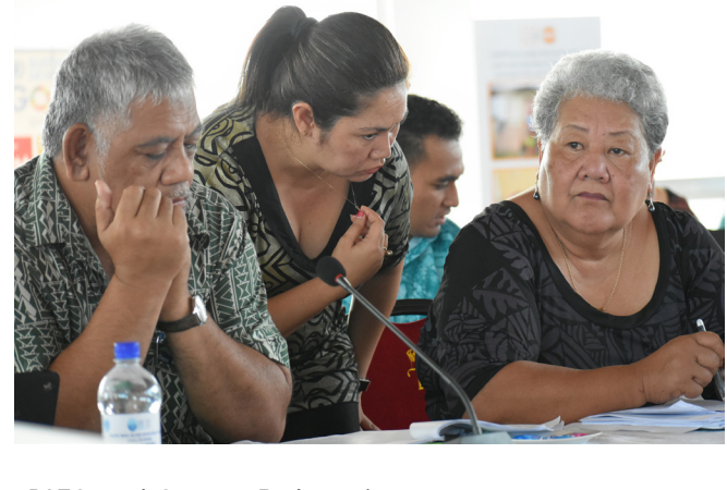
PIFS and Samoa Delegation