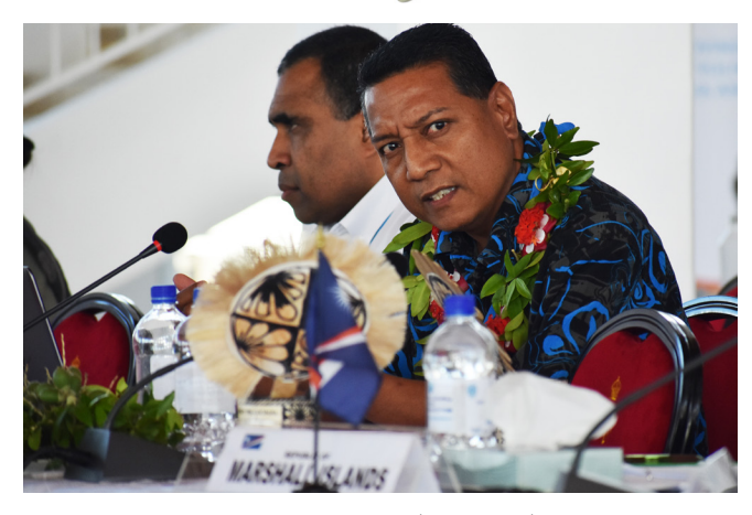
High Commissioner Teaabo (Kiribati)