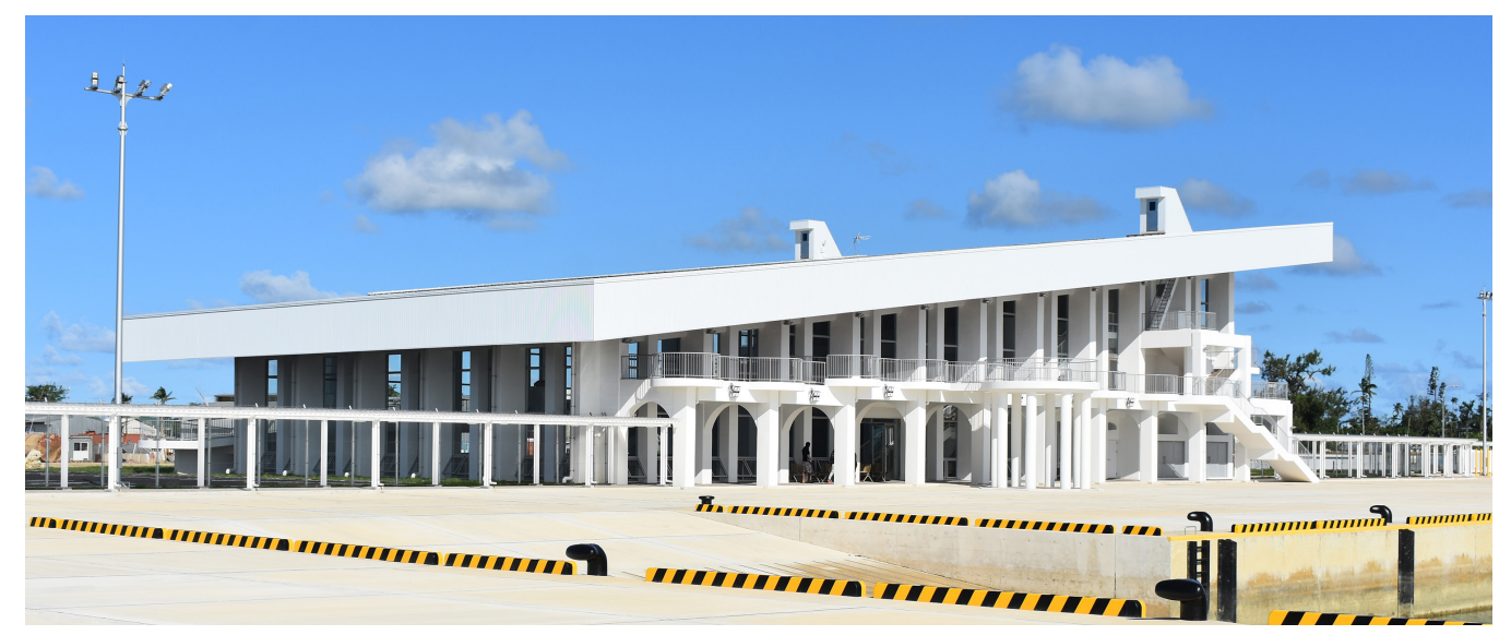
"King Taufa'ahau Tupou IV Domestic Terminal"- venue of the Pacific SIDS Regional Preparatory Meeting".