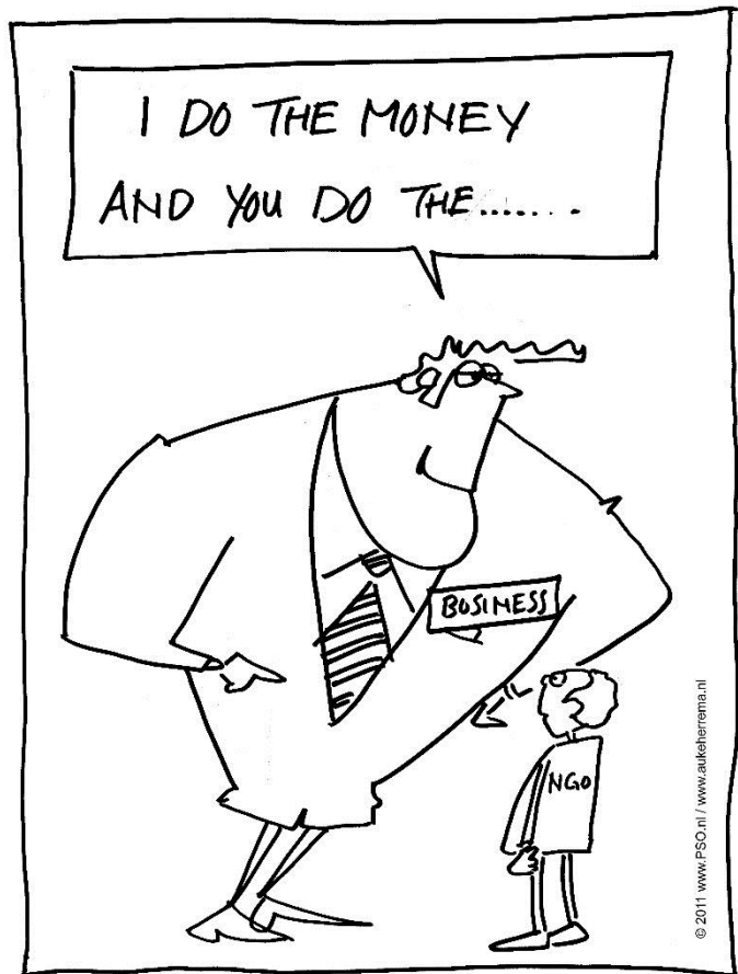
KNOWING YOUR ROLE