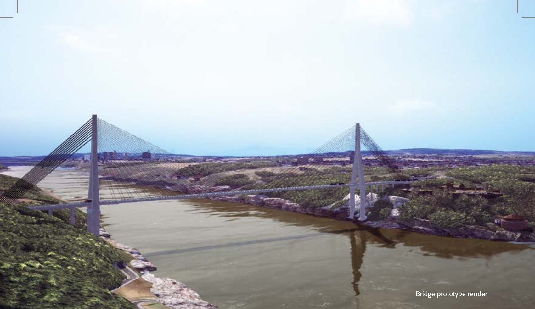
Bridge prototype render