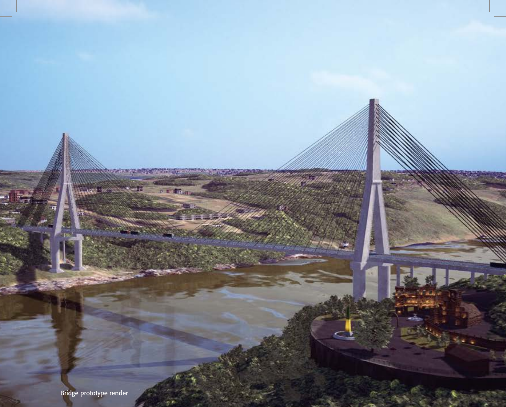
Bridge prototype render