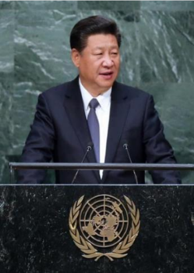
the Guidelines for the Thirteenth Five-Year Plan (March, 2016)