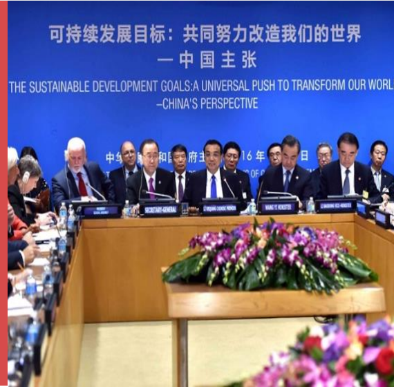
Progress Report on Implementation of the 2030 Agenda for Sustainable Development

"these achievements demonstrate the great efforts and strong commitments made by the Government of China to achieving sustainable development within China and globally. China has been a true leader in promoting South-South cooperation for development." (Aug. 2017)