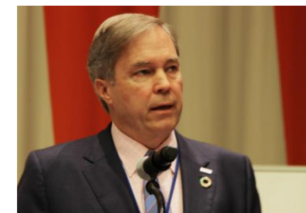
David MacLennan, Chairman and CEO of Cargill, addressing the SDG Business Forum

Dialogues throughout the week underlined the fact that realizing the ambitions of the SDGs is beyond the reach of any actor in isolation and instead calls for new and innovative forms of collaboration at scale.