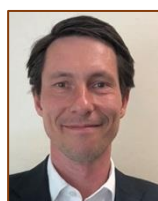
Sami Pirkkala Secretary General of the National Commission on Sustainable Development at the Prime Minister's Office, Finland

Evaluation is crucial in assessing value, worth, and merit of national SDG-related policies, plans, and results, and can generate recommendations on how, in what direction, and how fast to drive change to achieve the SDGs. In crisis contexts, evaluations can contribute towards agility in response, re-routing strategies towards the most relevant SDGs, and adjusting resources with a focus on the most marginalized.