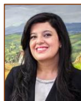
Pilar Garrido Minister of National Planning and Economic Policy (MIDEPLAN), Costa Rica