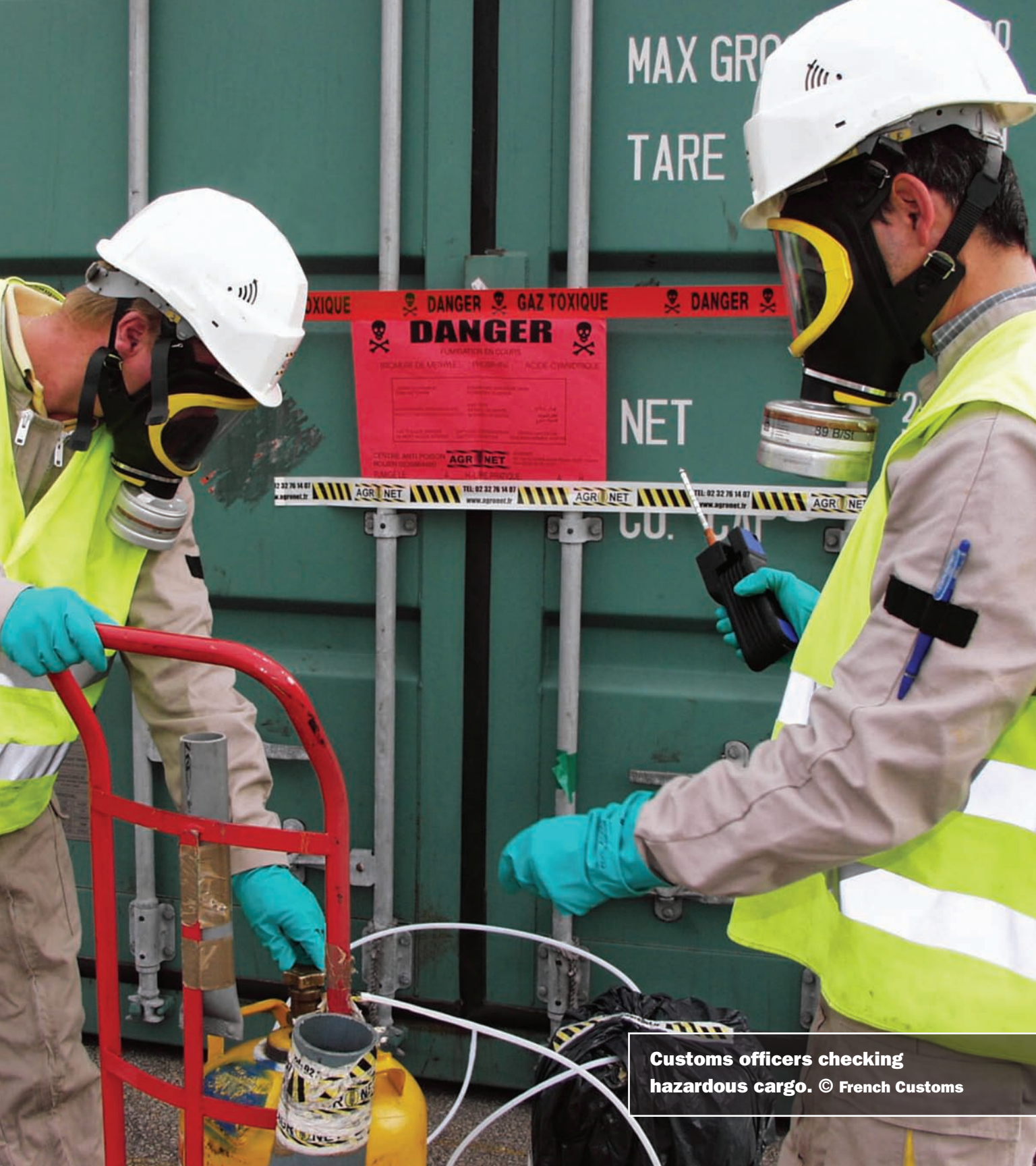
Customs officers checking hazardous cargo.