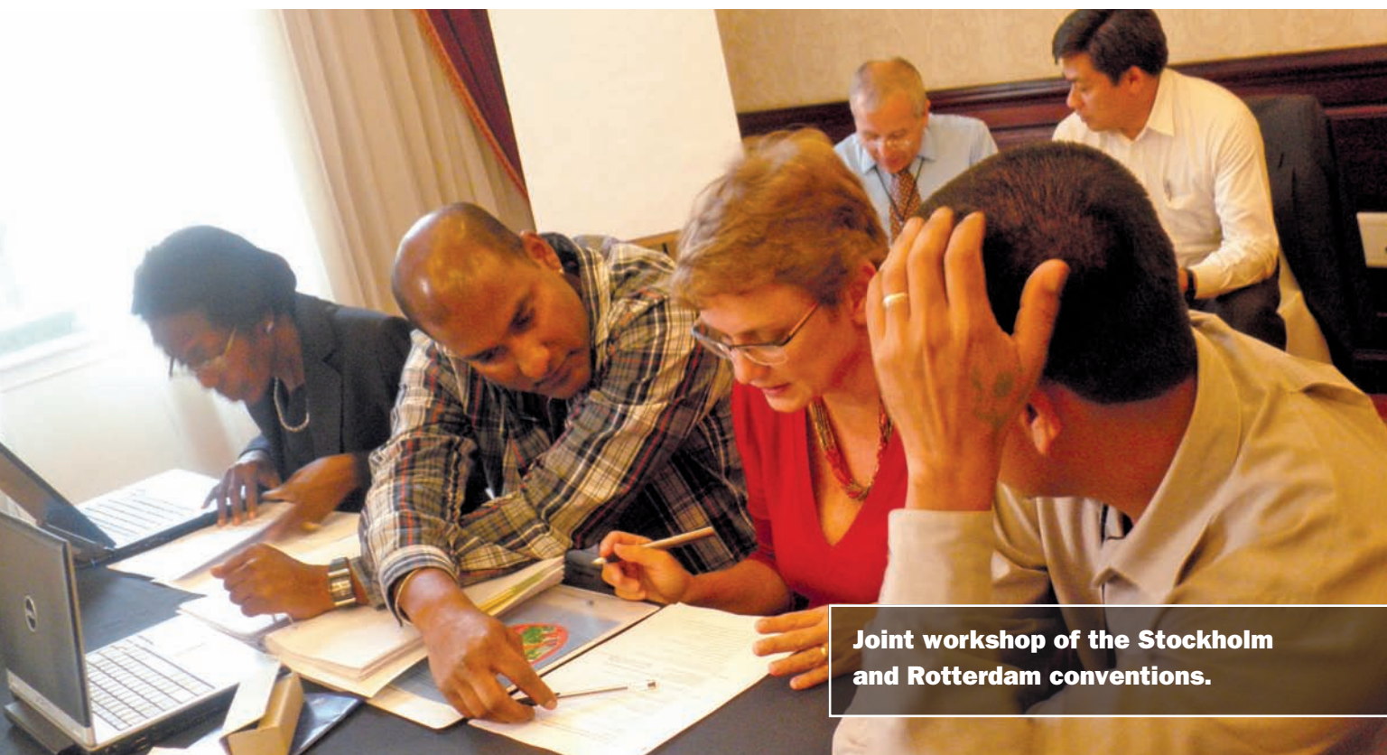
Joint workshop of the Stockholm and Rotterdam conventions.

The best way to achieve this has been identified to be a joint training programme that raises awareness and promotes opportunities for information exchange under the conventions, thus developing competencies that would continuously assist countries to implement chemicals risk management through involvement of national partners and experts from both committees, while also exploring an