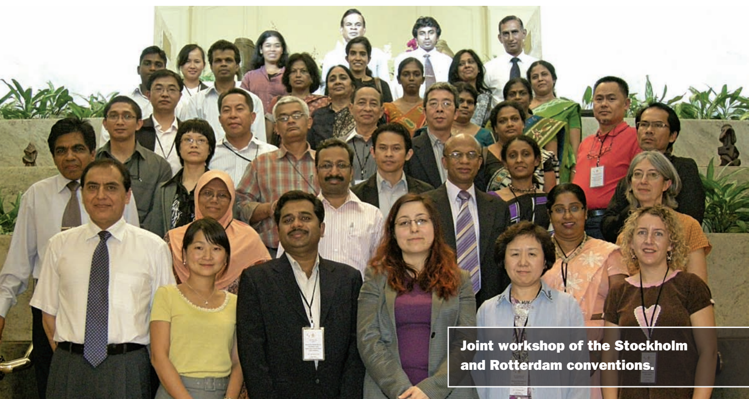
Joint workshop of the Stockholm and Rotterdam conventions.

To conclude, the training programme of the Rotterdam Convention's CRC and the Stockholm Convention's POPRC for Parties' effective participation has facilitated fruitful information exchange and clear understanding on the work of the two committees. It is the first of its kind with such an extent