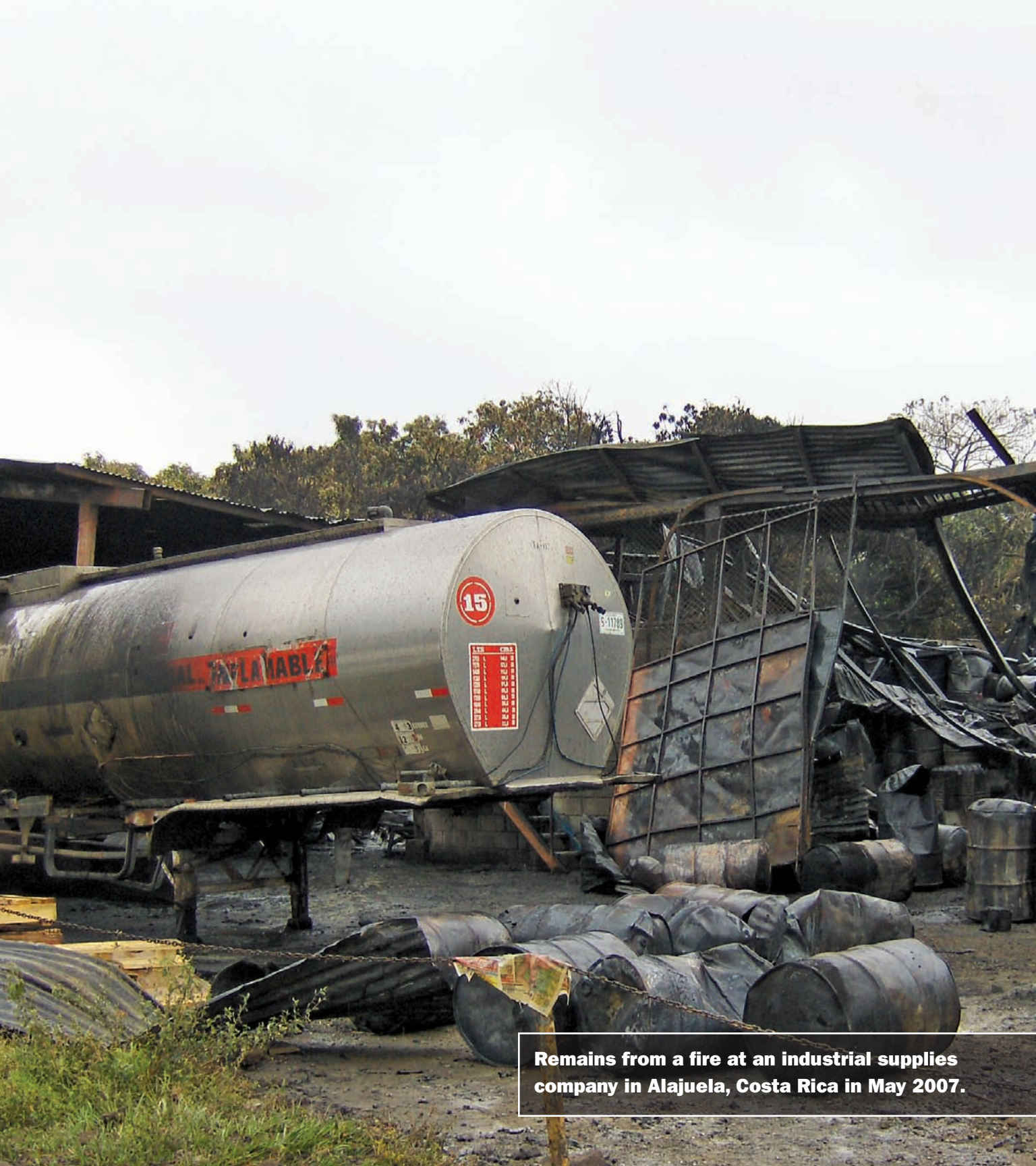
Remains from a fire at an industrial supplies company in Alajuela, Costa Rica in May 2007.