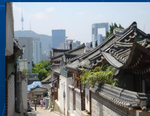
Seoul, Rep. of Korea, Urban Renewal Programmes (Cheonggyecheon & Bukchon Village) 1