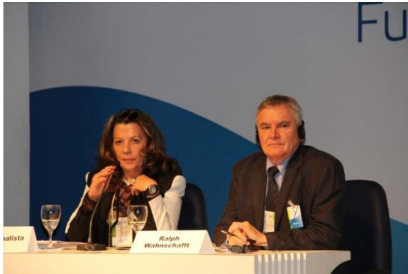
Senior representative of EletroBras Furnas, Rio de Janeiro, Brazil, Division for Sustainable Development, United Nations, DESA, New York co-presided Session 4