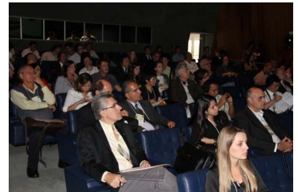
All seats occupied and all ears on the speakers