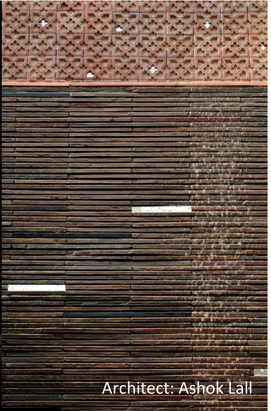
Architect: Ashok Lall