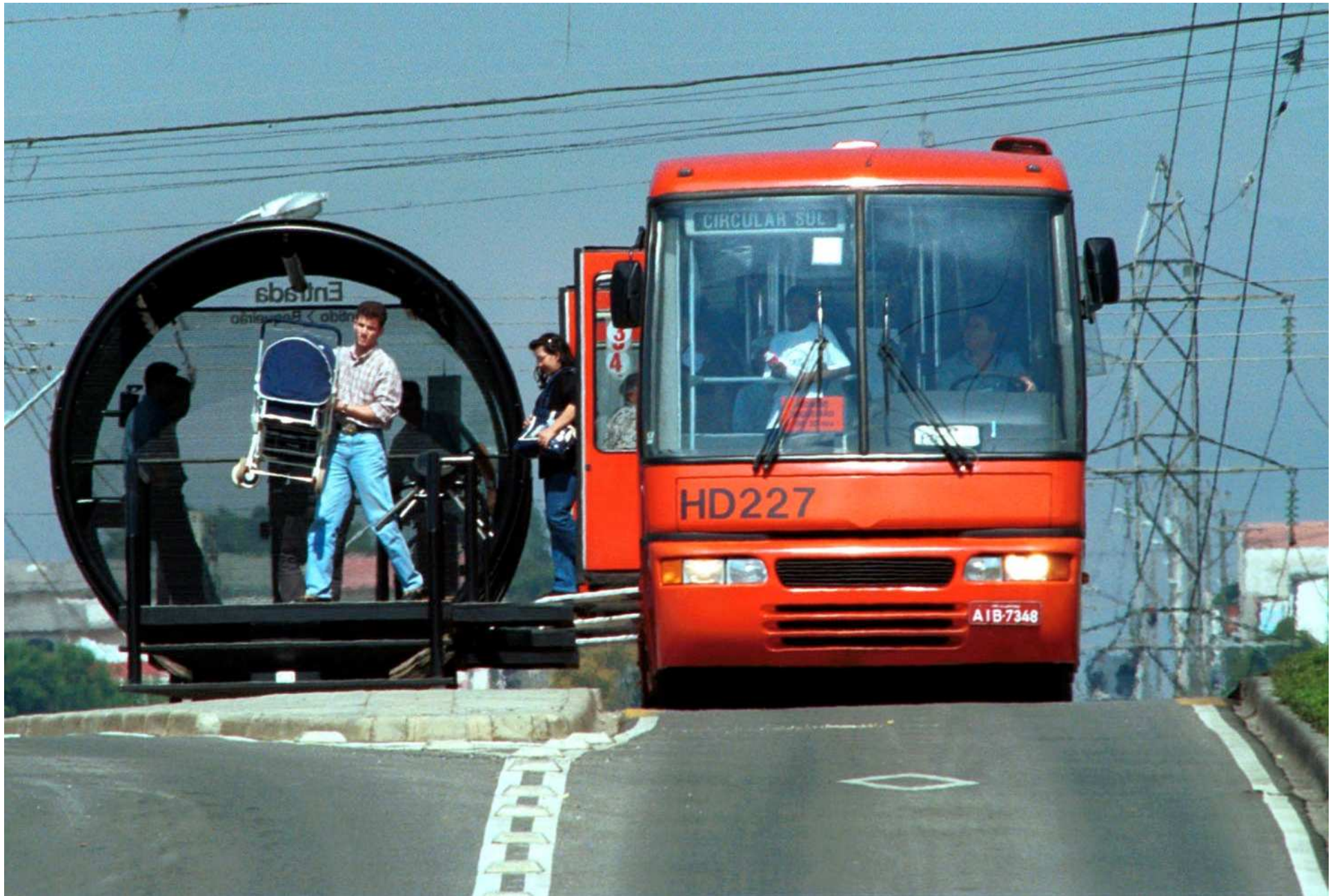
BUS RAPID TRANSIT (BRT) IN CURITIBA, BRAZIL