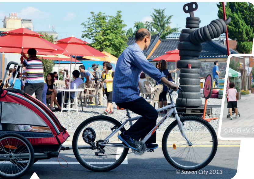
A passing cyclist looks on as residents occupy a new public space, formerly a parking lot