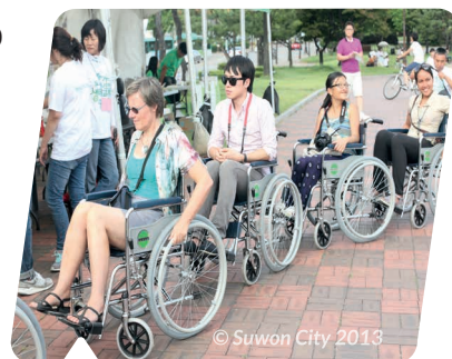
Led by volunteer guides, visitors took part in various tours including a wheelchair tour

The broad range of ecomobile vehicles from 10 different countries attracted great attention from visitors, who drew inspiration from the images of future transport modes. 35 types of ecomobile vehicles were displayed at the vehicle exhibition, alongside a state-of-the-art bi-modal tram. More than 176,000 visitors tried out the electric scooters, e-bikes, and various bicycles available at the rental station and test-track in a real-life setting, exploring everyday alternatives to their cars.