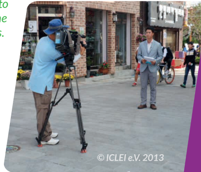
A JIBS film crew shoots scenes in the ecomobile neighborhood. A Festival documentary aired by KBS on 15 October saw Haenggung-dong shoot to the top of national search engine rankings.