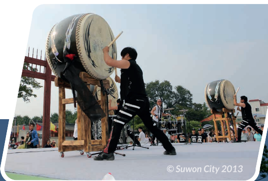
Numerous cultural programs added a festive mood to the EcoMobility neighborhood in September

“Due to the Festival, the culture of cycling is spreading, because there are no cars in this area. And that is exactly what we want, because we like to ride bicycles.”