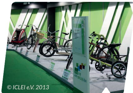
The exhibition hall displayed 35 different types of unique ecomobile vehicles

EcoMobility World Festival attracted more than 1 million visits to the renowned 'EcoMobility Neighborhood' of Haenggung-dong. To ensure that the local economy received a boost from the Festival activities, a coupon scheme totaling €200,000 in value was introduced and adopted by 85% of neighborhood shops. A variety of programs attracted tourists to the Festival neighborhood, including a vehicle exhibition, test-tracks and vehicle tours. Cultural activities and weekend markets added a festive mood to the month-long event. More than 20,000 visits were recorded on various tour programs, designed to provide participants with a thorough introduction to the neighborhood, and an in-depth understanding of applied EcoMobility. With universal access as a key consideration of the Festival works, an impaired mobility tour drew partakers through the streets in wheelchairs or with blindfolds, highlighting the experience of navigating the urban realm for disabled persons.