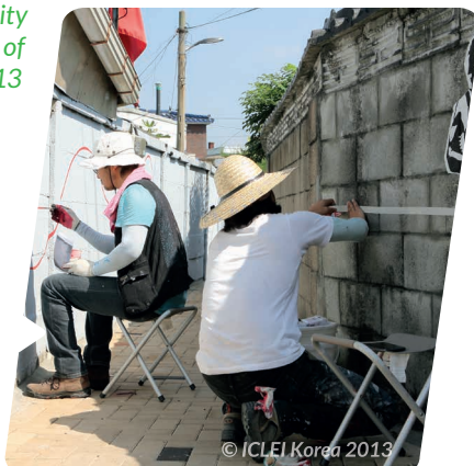
4. Repaved alleys decorated with street art August 2013