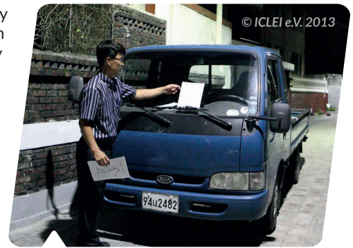
City official affixes notice reminding owner to remove the vehicle leading up to the Festival

“Before, the traffic was really heavy here, and there were always problems with the cars. Now it is nice, I am really satisfied. I hope this condition will continue.”