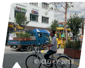
Planting pots were redistributed and yellow parking lines were painted in the neighborhood following the Festival

A citizens' round table was hosted by Suwon City on 13 November, feeding in to the future transport policy-making of Haenggung-dong. Around 300 participants outlined speed restrictions, parking controls and one-way systems as the way forward, calling also for the project area to be extended to include the entirety of Haenggung-dong.