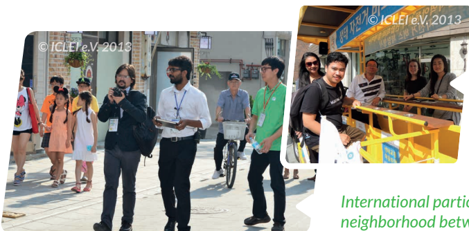
International youth activists connected with the Suwon Citizen's Bike School, drawing inspiration and lessons to take home to Indonesia.

The second edition of the ICLEI EcoMobility Congress series attracted 600 local and international actors from the sustainable mobility field to study and explore the ecomobile neighborhood. Over 20 sessions framed EcoMobility from a myriad of perspectives, including urban regeneration, local leadership, social inclusion, public health, and financial and institutional frameworks. The 50 local governments in attendance affirmed the Suwon 2013 EcoMobility Impulse, acting as a guiding document for local governments to review existing transport developments and steer planned investments towards EcoMobility.