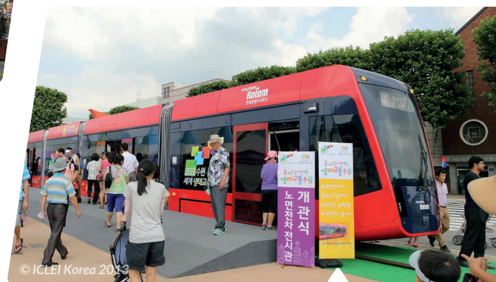
A model tram carriage was displayed at the Festival, introducing the mayor's plans for the city down the pipeline