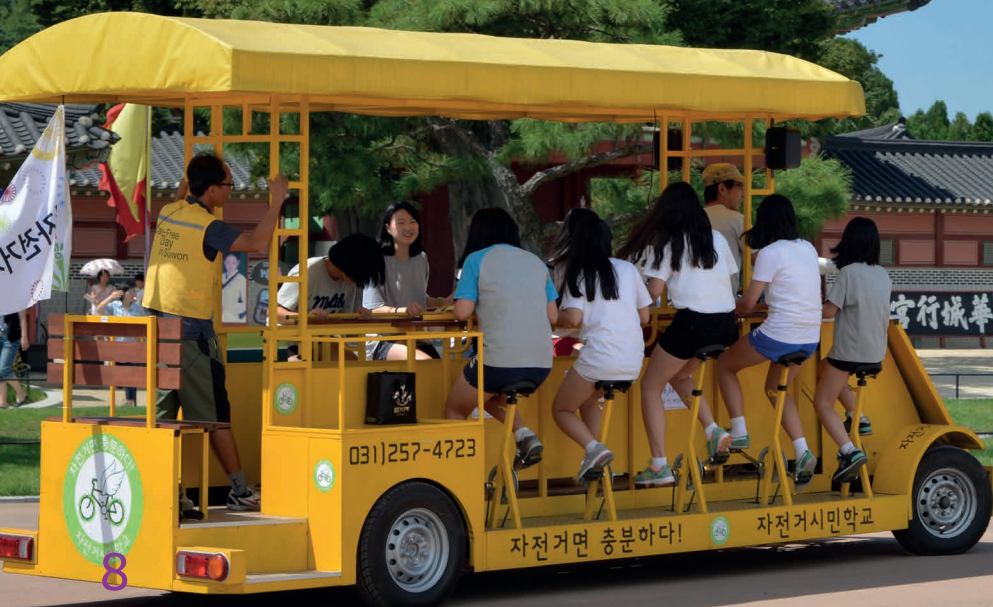
A bicycle bus handmade by Citizens Bike School was a big hit at the Festival

“878 vehicles were on show in the neighborhood including electric bikes, electric carts, velotaxis, electric scooters, LEVs, kids' and cargo trailers, multi-purpose tricycles and numerous unique prototypes”