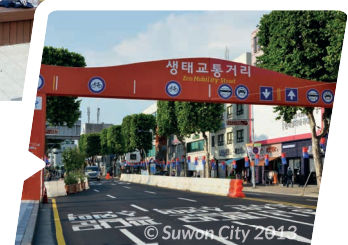
6. Jeongjo-ro turns ecomobile with new lane allocations restricting cars in September 2013