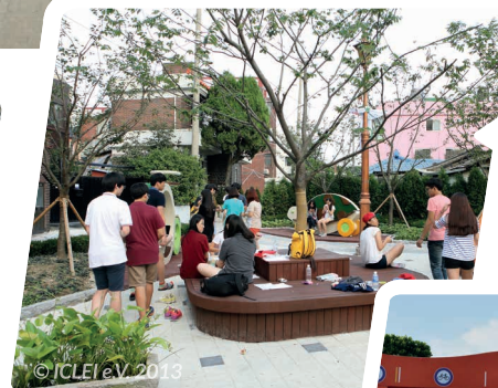
5. Residents enjoy a new pocket park created in their neighborhood, in September 2013