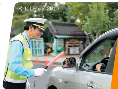
'Best driver' volunteers guide car drivers to parking lots outside of Festival area

Following extensive consultation and explanation, the city developed plans for how the residents would live car-free for one month, addressing the full spectrum of neighborhood mobility needs.