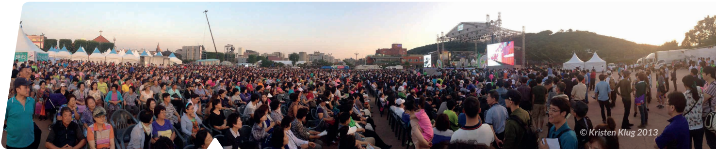
A 5,000 strong crowd gathered on Haenggung Plaza to witness the joint opening ceremony of the Festival and the EcoMobility 2013 Suwon Congress.

Suwon attracted widespread attention from international media outlets and experts, as the world looked on to see how an inner city neighborhood would live without cars for a month. International interest was generated through publicity and through a network of endorsing partners, including a UN-Habitat EcoMobility blogging competition, which awarded three prizes of an expenses paid trip to the Festival. In addition, an ICLEI organized Festival video contest attracted almost 30 entries, capturing diverse interpretations of the meaning of EcoMobility to disseminate through social media.