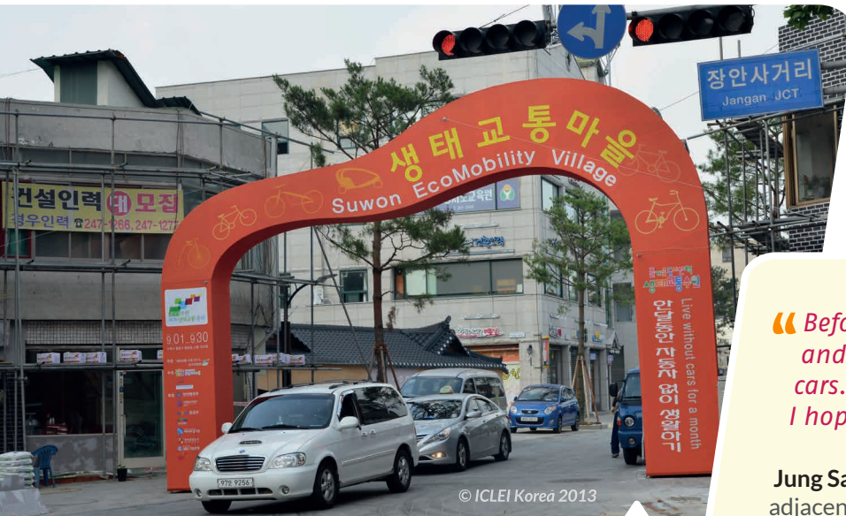
Cars leaving the neighborhood for the temporary parking lot the day before the Festival

On the eve of the Festival opening, onlookers questioned if the 'Suwon EcoMobility Village' would indeed be free of cars the next day. During the Festival, more than 98% of the registered cars left the designated area. This achievement was only possible because of residents' support and cooperation in removing cars from the neighborhood streets. The consultation process surrounding the car-removal began one year before the Festival in 2012.